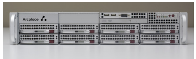
Arcplace Archiving Appliance

The use of a high-capacity, redundant storage system ensures that the Arcplace Appliance is able store very large volumes of data, while making it possible to efficiently search and retrieve this data.